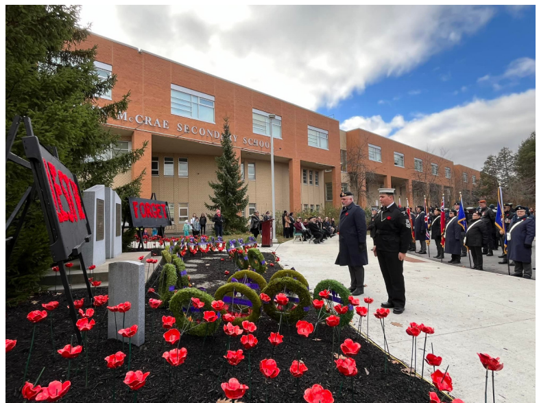
Photo from 2023 Remembrance Day Ceremony