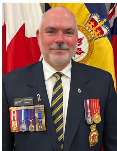
Vimy Memorial Bridge