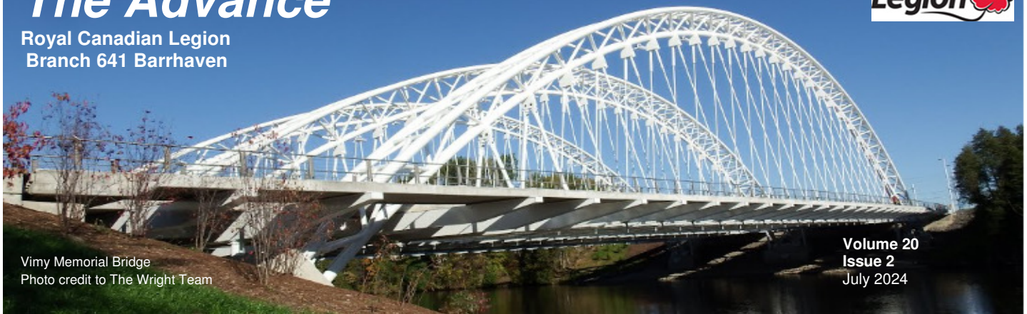
Vimy Memorial Bridge