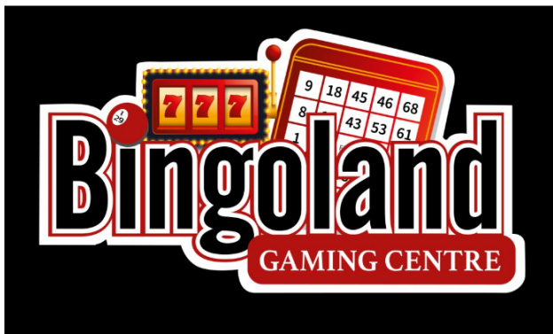
"Supports RCL Branch 641 Barrhaven and our Veterans"