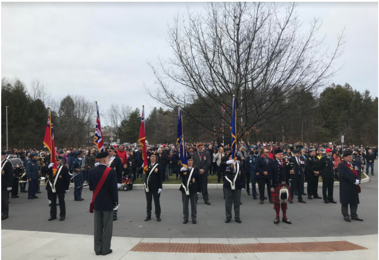
2022 Remembrance Day Ceremony

** Supporting the Poppy Campaign means supporting Veterans in need and Veteran and local community programs. *